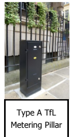
Type A TFL Metering Pillar