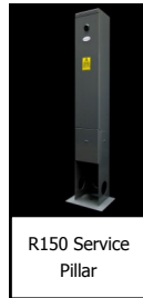
R150 Service Pillar