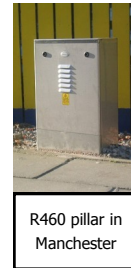
R460 pillar in Manchester