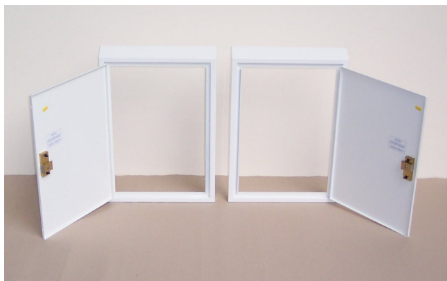
R28E and R28G Replacement Door and Frame

The doors are fitted with the preferred soft-spring slam locks to facilitate closing the door without having to use the key.