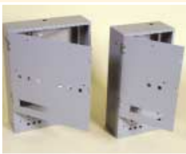
Industrial boxes in a range of sizes

Please enquire if you think we can help.