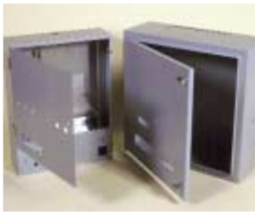
Wall mounting distribution boxes